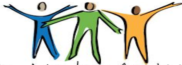
New Members Are Joining