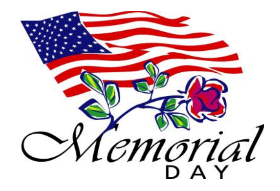
May 27, 2024... Remember & Honor all who served.

An afternoon at a Playhouse Musical is always an afternoon well spent!